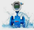
Flow Meter (Electromagnetic)