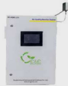
Ambient Air Quality Monitoring Station (AAQMS)