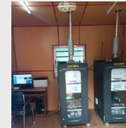
Continuous Ambient Air Quality Monitoring Station (CAAQMS)